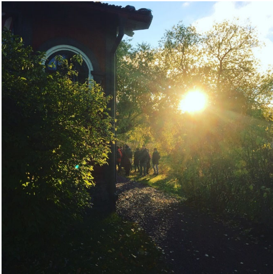
Garden History members at Carl Larssongården in Dalarna 2017.

October 7-8, 2021 Lund, AF-Borgen, Gustafsalen